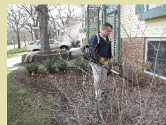
Spring Clean Up Coon Rapids, MN