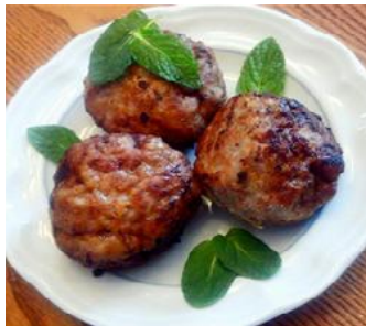
Keftedes (Greek Meatballs)

Cooking instructions: Mix together all of the ingredients listed except for the oil and flour. Mix all of this up like mixing for a meat loaf. In a frying pan, add your mix of olive and vegetable oil, about an 1/8" deep to fry the meatballs. In a bowl, add flour. Once meat is mixed up, using a larger spoon, make 1 to 1.5" meatballs, and then roll each meatball in flour, bumping off the excess flour. At this time, turn on the heat to medium/high and start frying your meatballs, turning them every few minutes, so they don't burn. Like frying bacon or anything else in a pan, place these