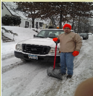
Snow removal in April. North Minneapolis

I have to apologize, as I am a bit late getting the April newsletter out, by one day! So, I'm going to combine both April and May together and we'll have two drawings instead of one.