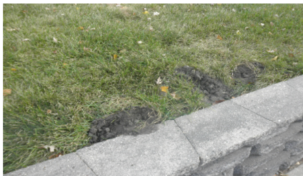
Mole damage caused by tunneling. Brooklyn Park, MN

Enter Fj Lawn Care! We will assess the damage and take the proper course of action to control these pests. We will get the customer on a trapping program keeping the tunnels constantly blocked, not giving these critters any other avenues to escape, slowly removing them from your yard. At the same time we will test the turf for grubs, which we are licensed to control with pesticides. Between aggressive trapping and grub control we'll get a good handle on them.